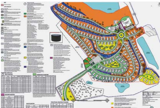
Above: A meadows plan prepared for a new build housing development incorporating sustainable urban drainage.

Whilst most consultations require a site visit, we can also offer advice and guidance over the phone or online. Get in touch with us and we'll be happy to discuss your project further.