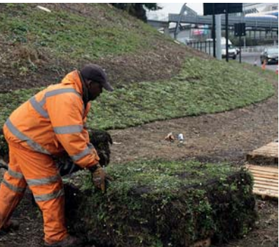
Above: Installing new meadows using Pictorial Turf. Even across large areas, installation can be completed in a number of days. Dependent on time of year, the meadow can be in full flower a few weeks later.