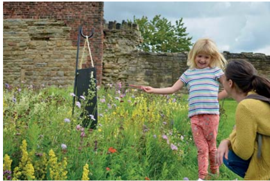
The meadows at Manor Lodge delight visitors of all ages, providing the perfect background for photos.

Since the middle ages, Sheffield Manor Lodge has played a significant part in the history of Sheffield and grew to be a major Tudor seat of power in the 16th century, famous for serving as a site of imprisonment of Mary Queen of Scots.